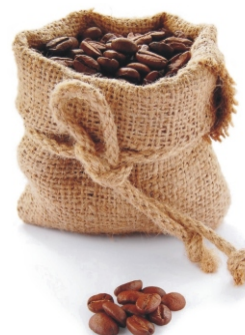
Arabica Coffee Powder

Coffee's effects: 1. Helps Metabolism – Can effectively promote body metabolism function, digestive organs operation, treat constipation and beneficial to newborn skin. 2. Anti-Fatigue – Contains lot of nutrients that can help users fights against fatigue, refreshing the brain, nutrition additional, rest and sleep time. 3. Emotional Control – Contains caffeine that can promote mental conduction release, such as dopamine and other substances that can effectively in controlling emotions and also reduce depression. 4. Prevent Damage from Radioactive – Contains substance that inhibits the radiation, always drinking coffee can effectively reduce damage from radioactive substances. 5. Prevent Gallstones – Caffeine in coffee can stimulate cholecystokinin, reduce cholesterol growth, the study found men that drink 200~300g of coffee daily can prevent formation of gallstones. Due to coffee can helps in digestion, because caffeine has function that can break down fat, therefore, we must drink coffee, especially after eating excessive meat or high-calorie foods, can cause gastric secretion, promote digestion & reduce stomach burden.